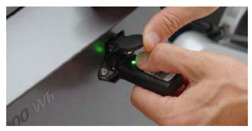
5. Insert the Battery Marriage Dongle into the charge port and press the activation button. Then remove.