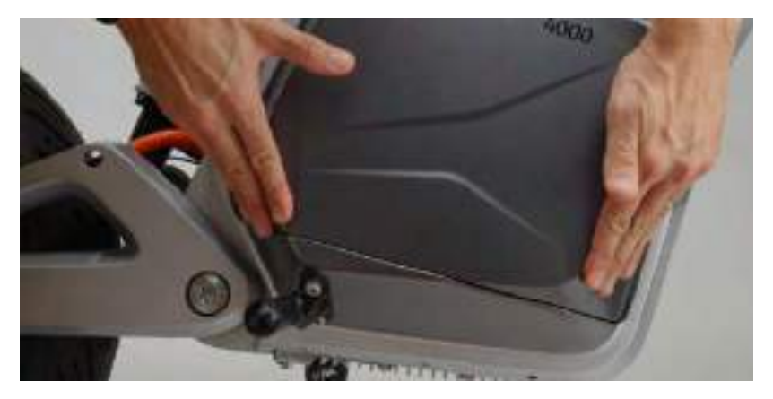
7. Reinstall the Battery Cover by first sliding in the top edge, then press firmly on the bottom to reseat the clips.