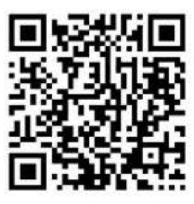
Watch our "Battery Removal and Installation" video.