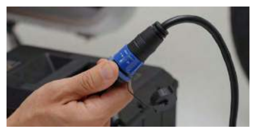
4. Connect the Metacycle Charger. Use the indicated arrows to align the connectors and twist the collar to lock.