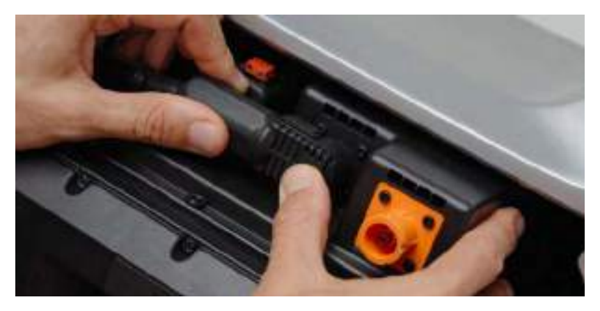
3. Align the Negative Terminal as shown, then push until it locks.