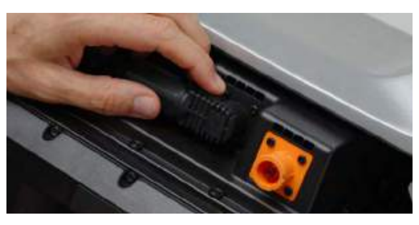
6. Disconnect the Negative (Black) High Voltage Connector using the same method.