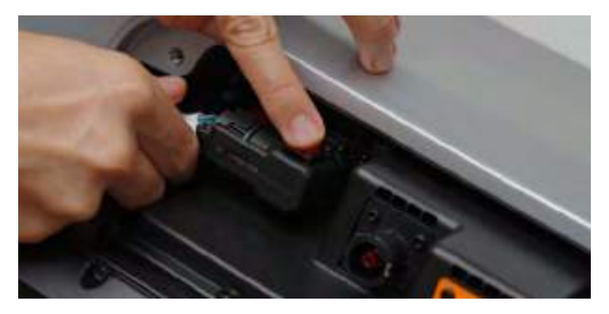
8. To disconnect the Low Voltage Harness, push the red terminal down and towards the Metacycle until it locks in place. Then, pull the harness away from the bike to disconnect.