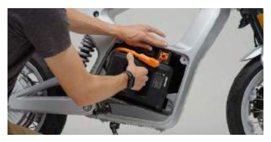
5. Gently pull the battery out to access the Negative (Black) High Voltage Connector.