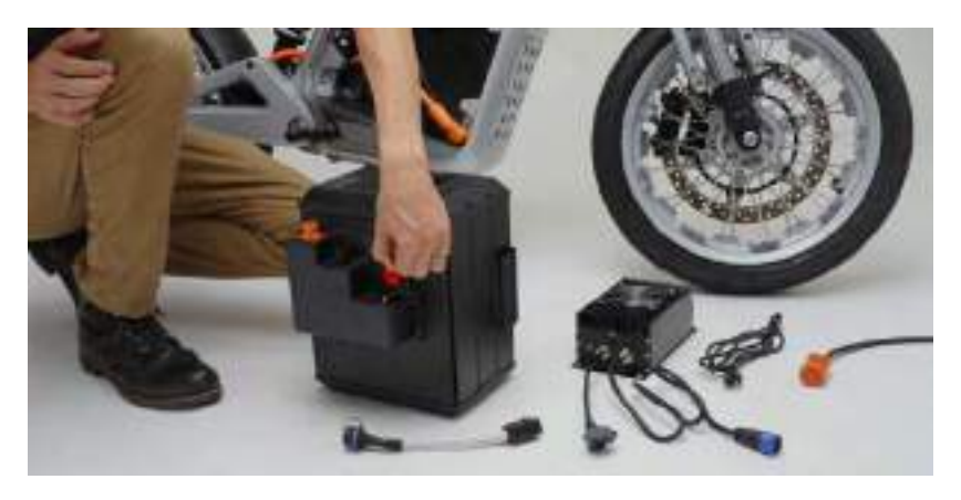
1. For off-bike charging, remove the cover.