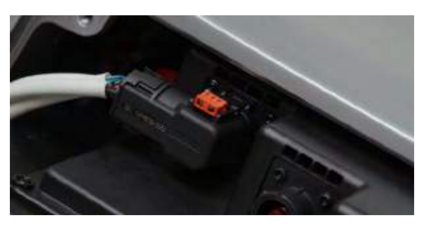
2. Connect the Low Voltage Harness until it locks.