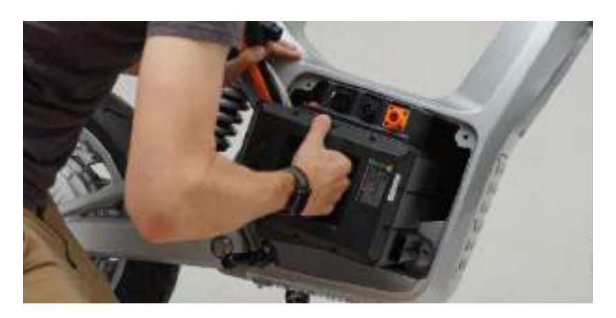
9. Hold the cables to the side as shown and pull the Battery to the edge of the Battery Compartment.