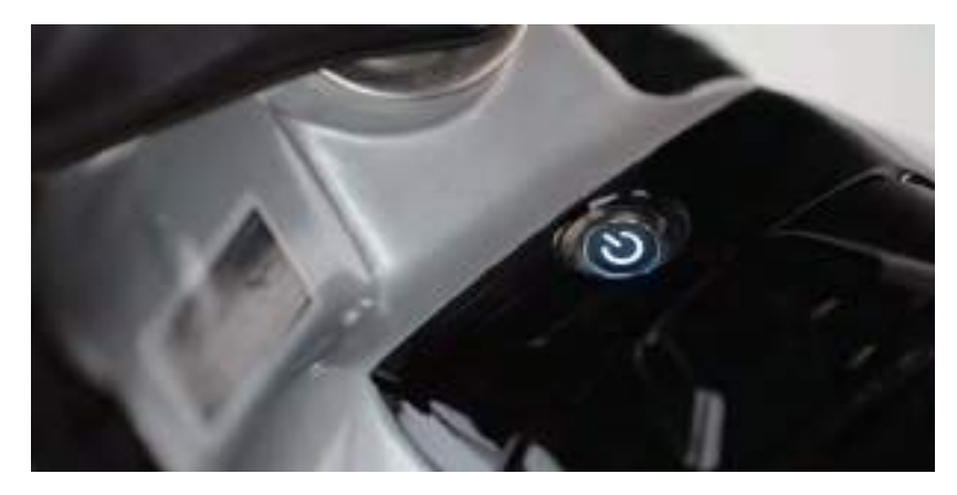
7. To START Metacycle, press and briefly hold the Power Button above the smartphone compartment.