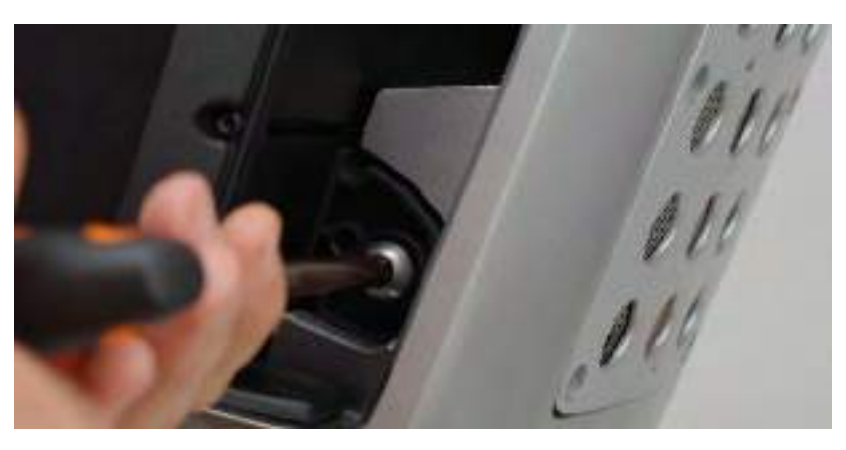
6. Reinstall the Battery Alignment Brackets and Retention Bolts (T50). Torque spec: 10 ft-lbs (14Nm)