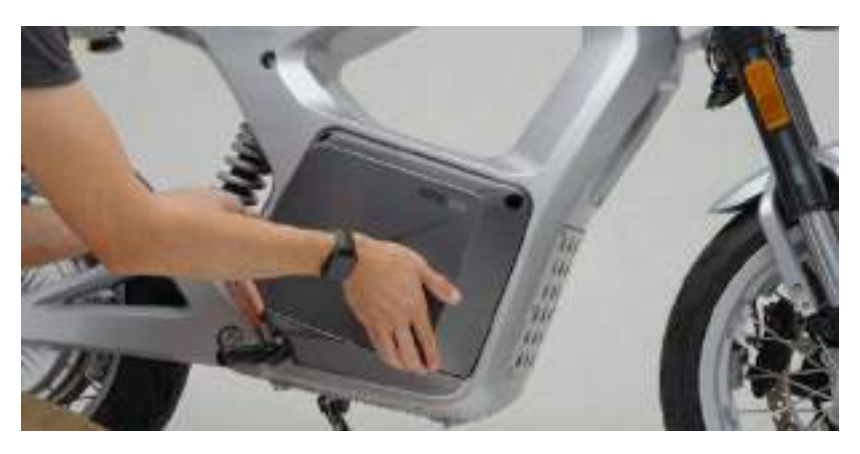
2. With both hands, grab the lower seam of the Battery Cover as shown. Pull up until you feel the retaining clips release. Then remove the cover.