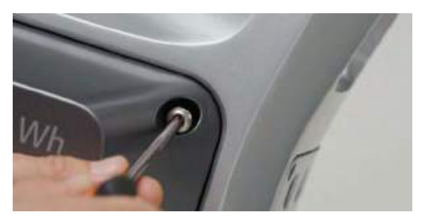
8. Reinstall the Battery Cover Bolts (T40). Torque spec 5ft-lbs (7Nm)

NOTE : The Battery Cover Bolts, Battery Retention Bolts, and their threaded holes in the frame are designed to be reused. Never use excessive force when initially threading the bolts as to avoid cross-threading. If using the provided T-Handle wrenches, tighten the bolts 1/8 of a turn past snug.