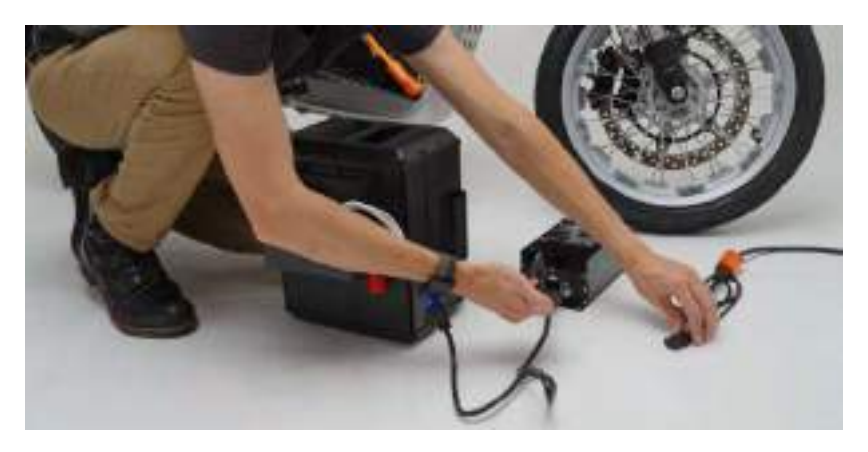
9. For off-bike charging, remove the cover.