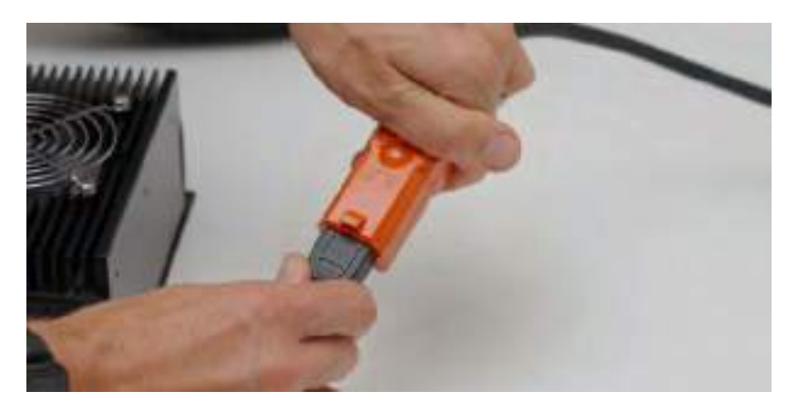
5 . For off-bike charging, remove the cover.