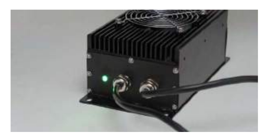
8. It will be solid GREEN when charging is complete.