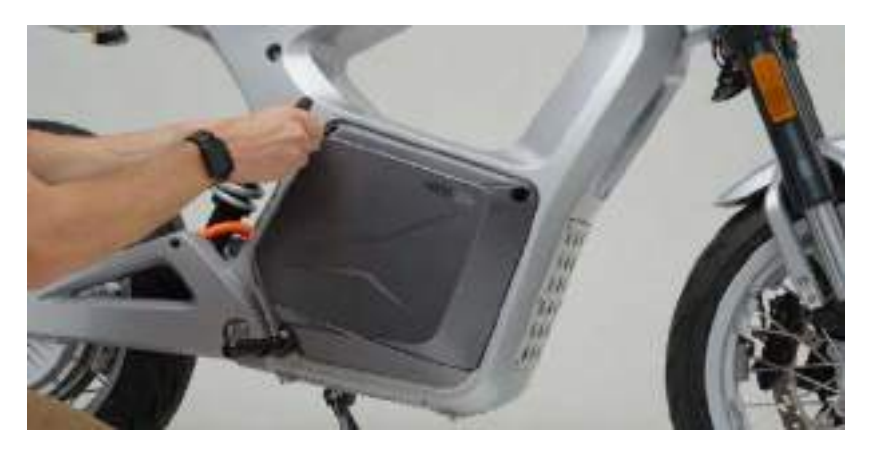
1. Use the T40 Wrench to remove the Battery Cover Bolts.