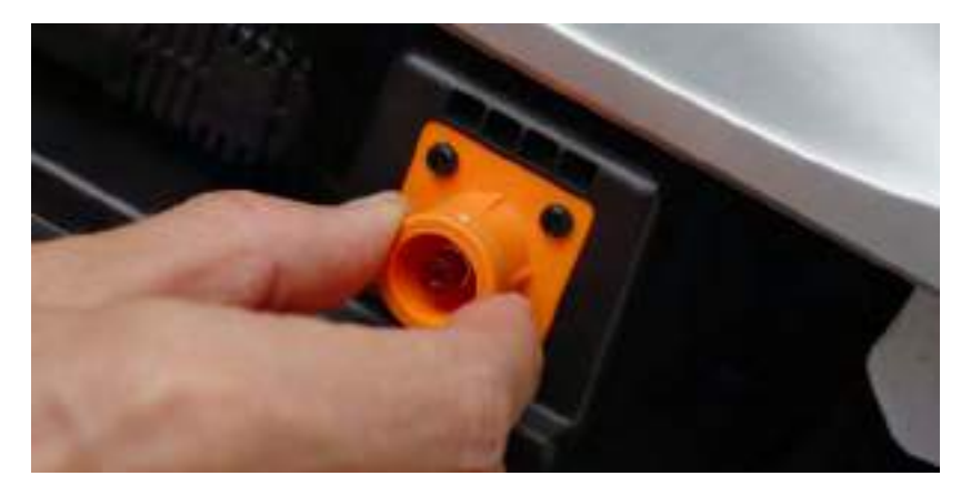
4. Be sure to align the large notch on the high voltage terminals with the arrow on the connector.