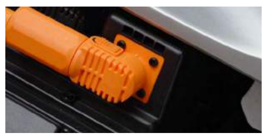
5. Align the Positive (Orange) High Voltage Connector as shown, then push until it locks.