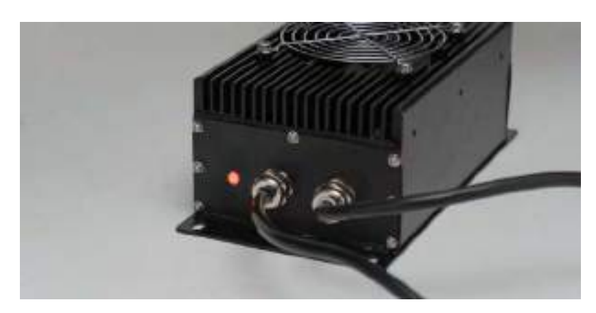
7. Once connected, the charger light will flash GREEN and RED for a few seconds. It will flash RED during the charging cycle.