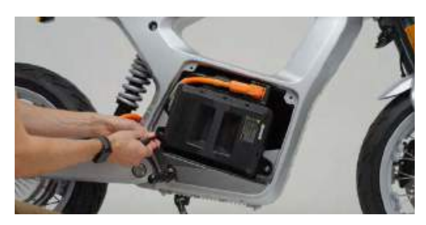
3. Use the T50 Wrench to remove the Battery Retention Bolts and Battery Alignment Brackets.