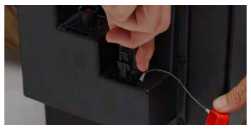
2. Connect the Off-Bike Charging Adapter by aligning it with the Low Voltage Port no the Battery, then push until it locks into place.