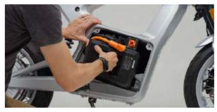
7. Gently pull the battery out further to access the Low Voltage Harness.