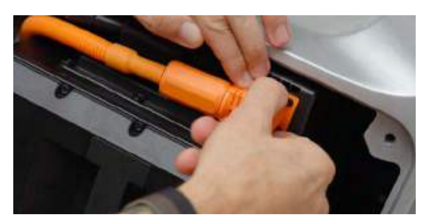
4. To disconnect the Positive (Orange) High Voltage Connector, pull and hold the lock towards the rear of the Metacycle. Then, use your other hand to pull the connector away from the battery.